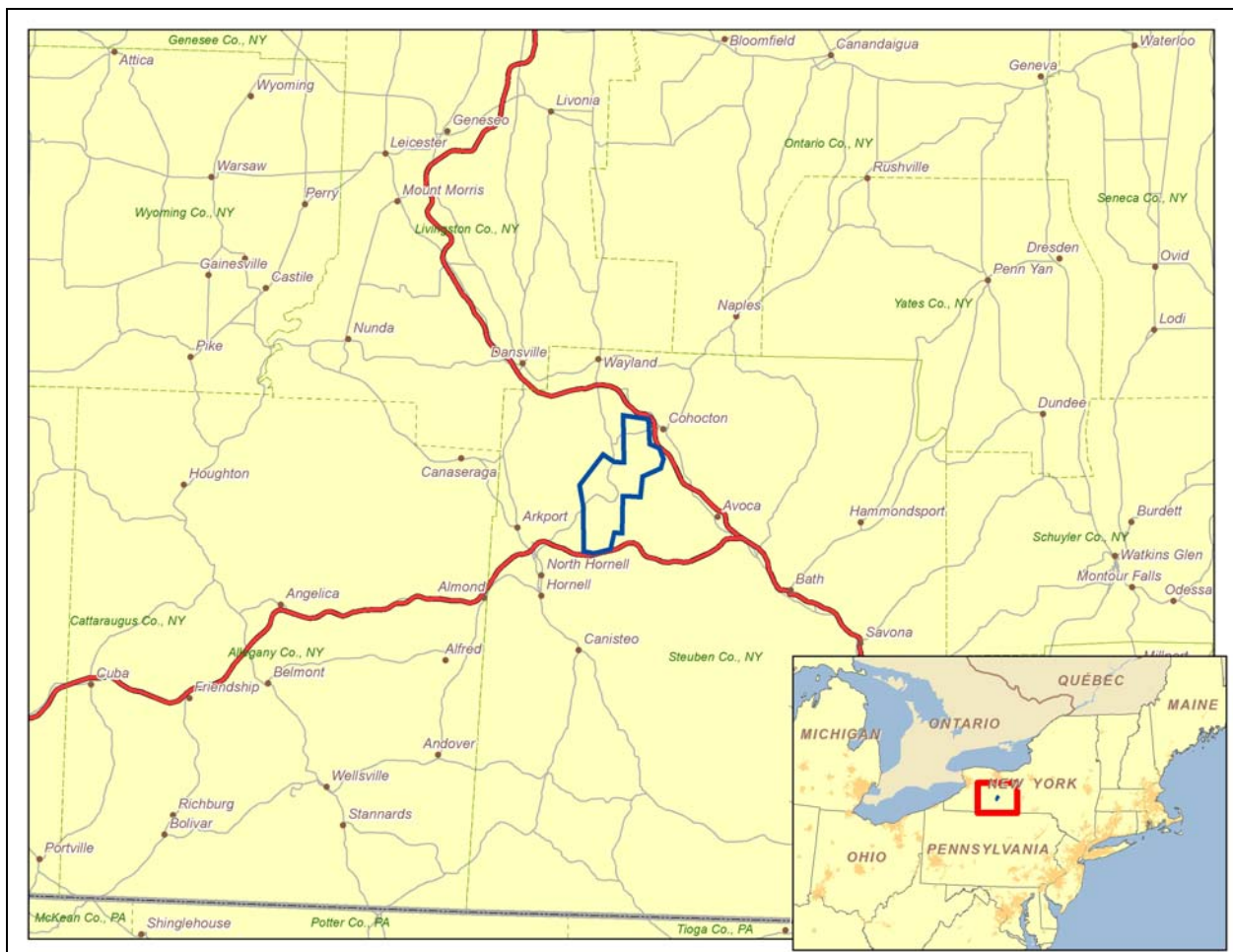
Figure 1: Wind Farm Project Area and Local Communities

The proposed wind energy project area and local communities are depicted in Figure 1, below.