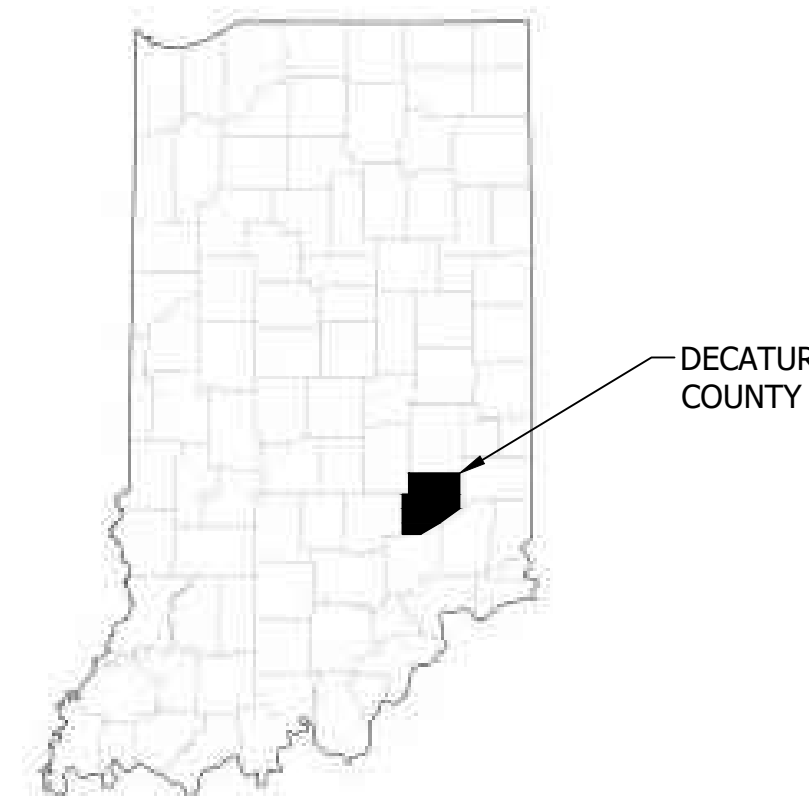
OVERALL AREA MAP NO SCALE