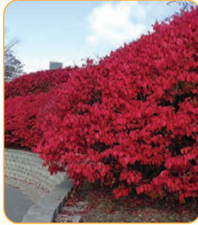
Burning Bush Euonymus alatus