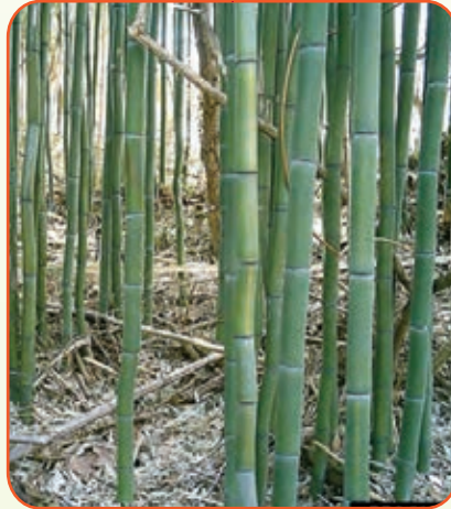
Yellow Groove Bamboo Phyllostachys aureosulcata