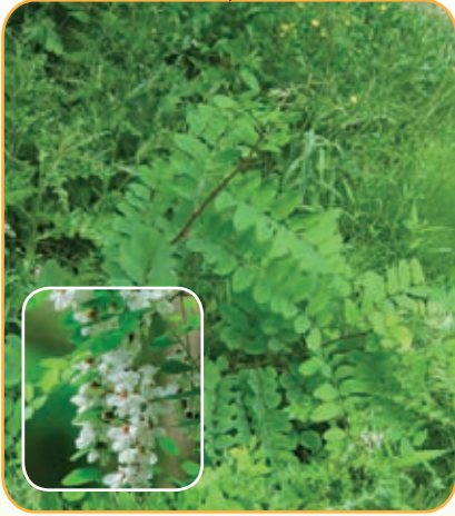
Black Locust Robinia pseudoacacia