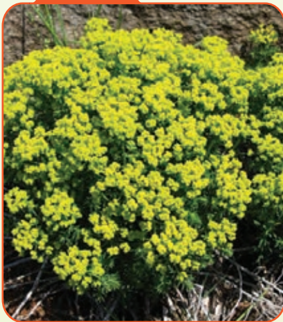
Cypress Spurge Euphorbia cyparissias