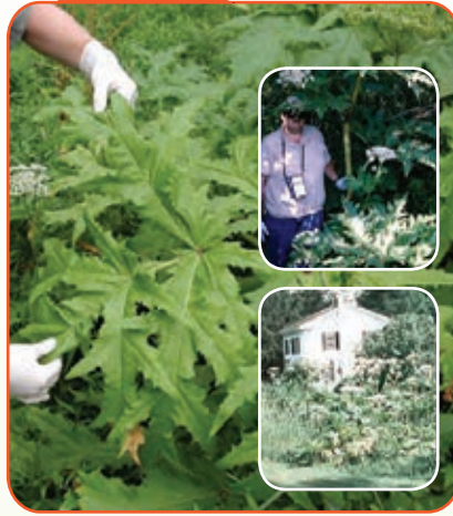
Giant Hogweed Heracleum mantegazzianum