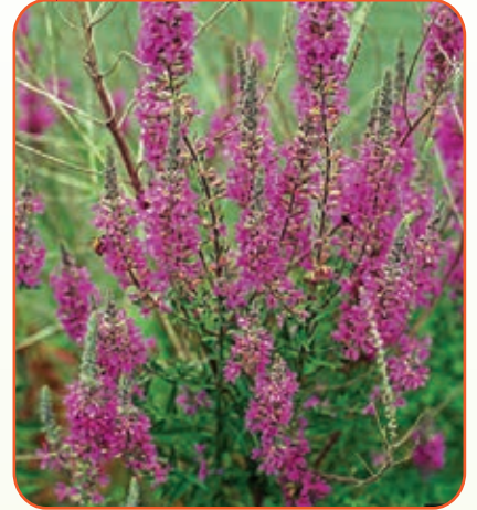
Purple Loosestrife Lythrum salicaria