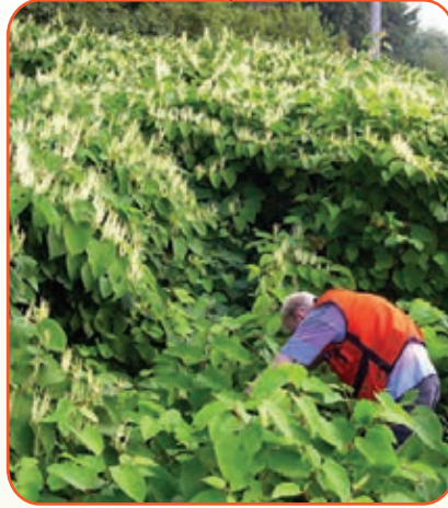
Japanese Knotweed Reynoutria japonica ( Fallopia japonica , Polygonum cuspidatum )