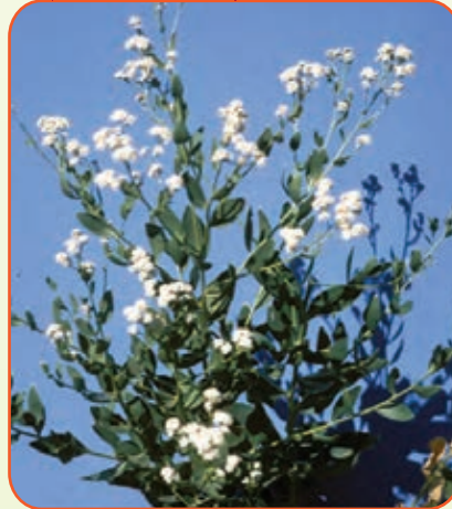
Broad-leaved Pepper-grass Lepidium latifolium