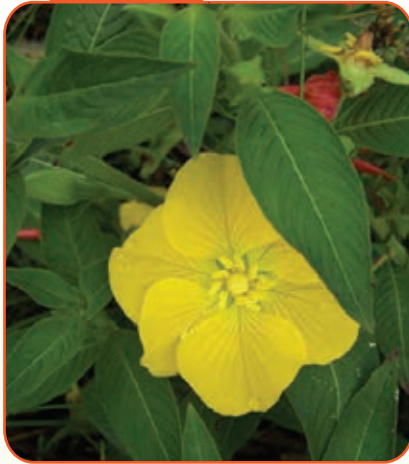
Uruguayan Primrose Willow Ludwigia hexapetala ( L. grandiflora )