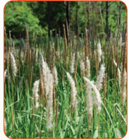
Cogon Grass Imperata cylindrica (I. arundinacea, Lagurus cylindricus)