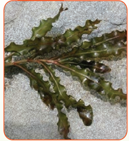
Curly Pondweed Potamogeton crispus