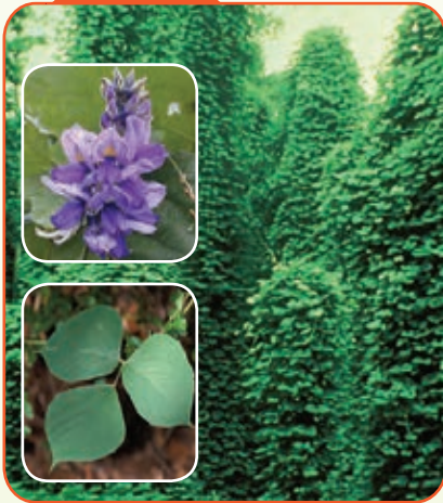
Kudzu Pueraria montana