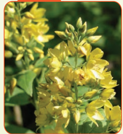
Garden Loosestrife Lysimachia vulgaris