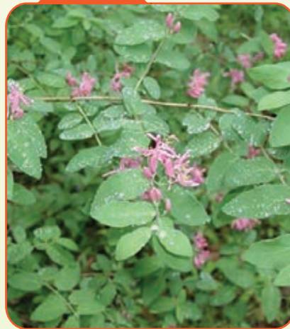
Fly Honeysuckle Lonicera x bella