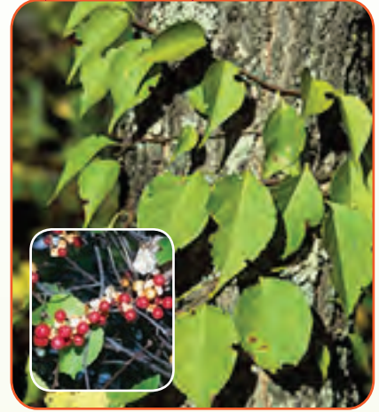
Oriental Bittersweet Celastrus orbiculatus