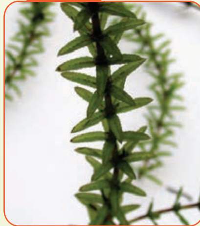
Hydrilla/Water Thyme Hydrilla verticillata