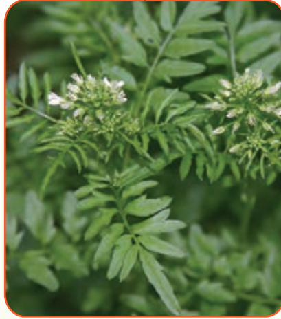
Narrowleaf Bittercress Cardamine impatiens