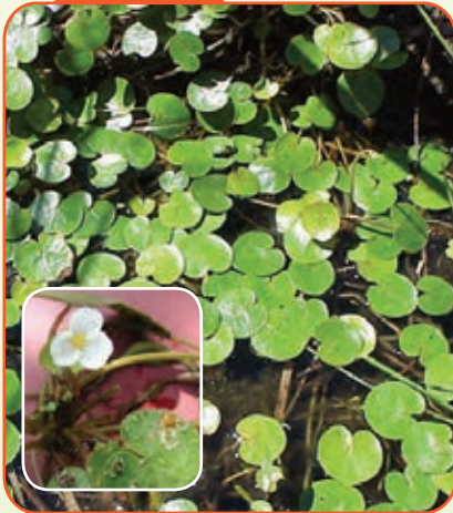
Frogbit Hydrocharis morsus-ranae