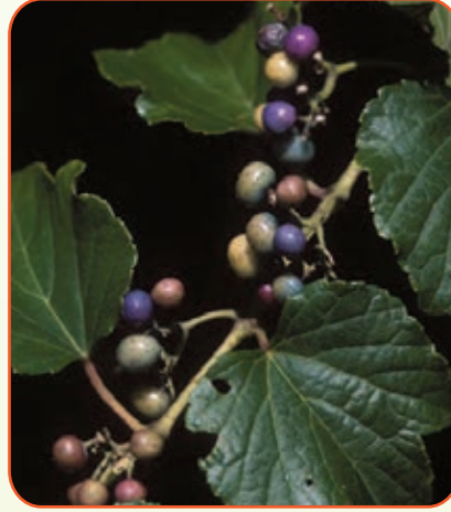
Porcelain Berry Ampelopsis brevipedunculata