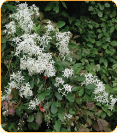
Japanese Virgin's Bower Clematis terniflora