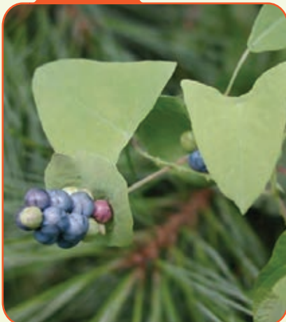
Mile-a-minute Weed Persicaria perfoliata ( Polygonum perfoliatum )