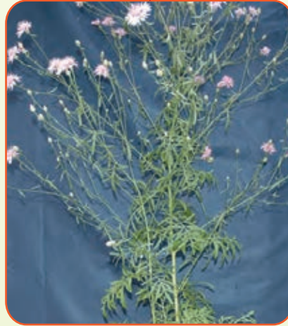
Spotted Knapweed Centaurea stoebe ( C. biebersteinii , C. diffusa , C. maculosa misapplied, C. xpsammogena )