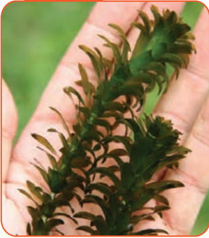
Brazilian Waterweed Egeria densa