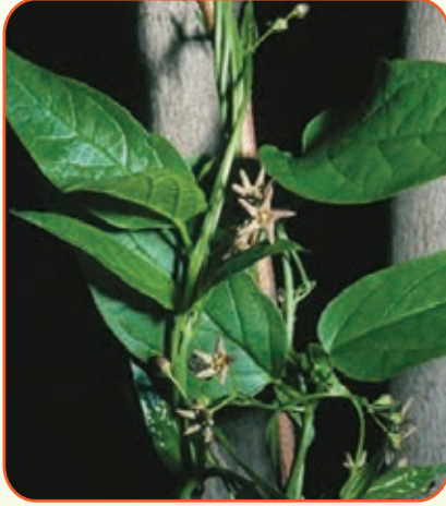
Pale Swallow-wort Cynanchum rossicum ( C. medium , Vincetoxicum medium , V. rossicum )