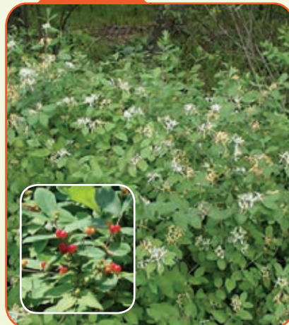
Morrow's Honeysuckle Lonicera morrowii