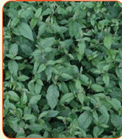
Japanese Chaff Flower Achyranthes japonica