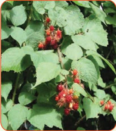
Wineberry Rubus phoenicolasius