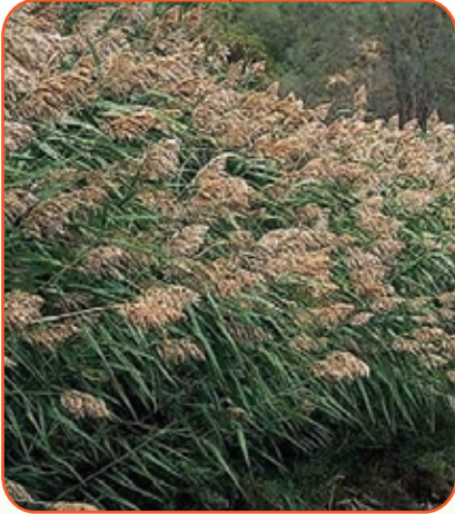
Common Reed Grass Phragmites australis