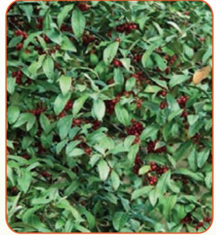
Autumn Olive Elaeagnus umbellata