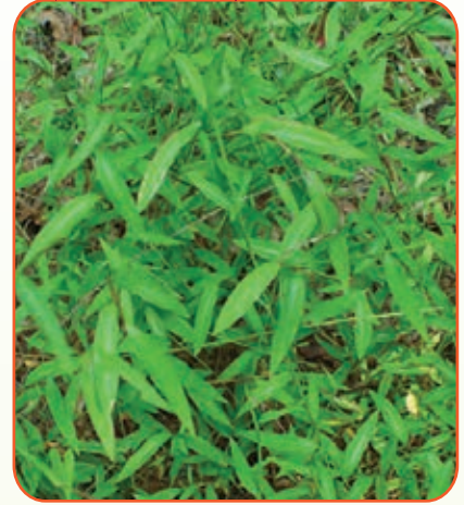
Japanese Stilt Grass Microstegium vimineum