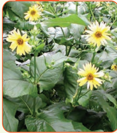
Cup-plant Silphium perfoliatum