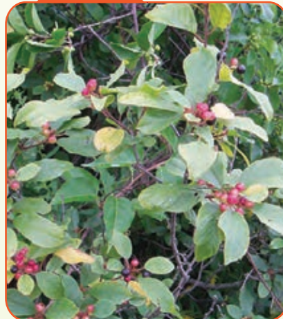
Smooth Buckthorn Frangula alnus ( Rhamnus frangula )