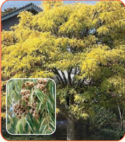
Amur Cork Tree Phellodendron amurense