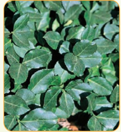
Winter Creeper Euonymus fortunei