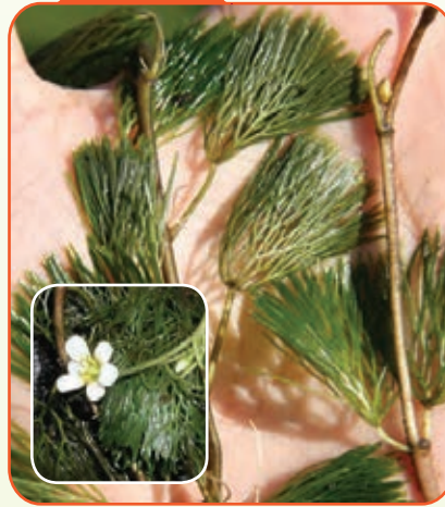
Fanwort Cabomba caroliniana