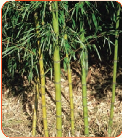
Golden Bamboo Phyllostachys aurea