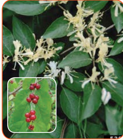
Amur Honeysuckle Lonicera maackii