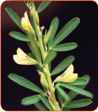
Chinese Lespedeza Lespedeza cuneata