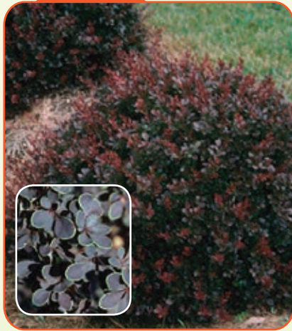
Japanese Barberry Berberis thunbergii