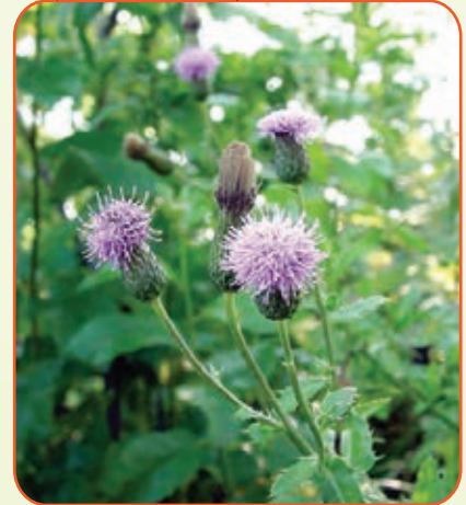
Canada Thistle Cirsium arvense ( C. setosum , C. incanum , Serratula arvensis )