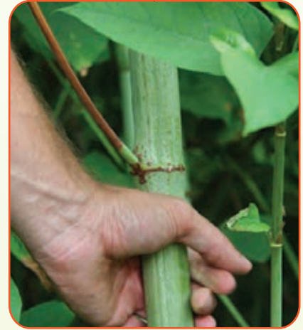
Bohemian Knotweed Reynoutria x bohemica ( Fallopia x bohemica , Polygonum x bohemica )