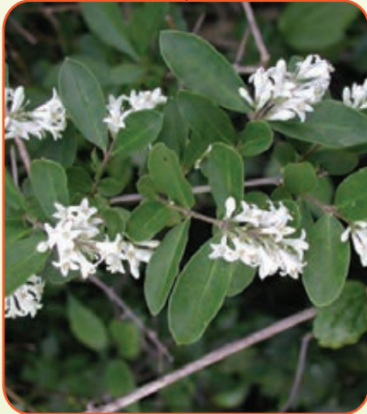
Border Privet Ligustrum obtusifolium