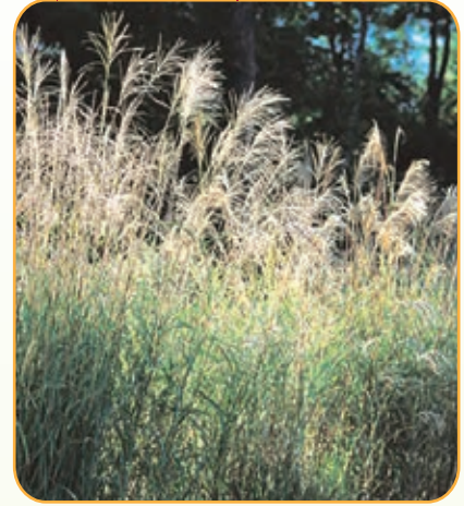
Chinese Silver Grass Miscanthus sinensis