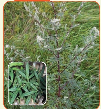
Mugwort Artemisia vulgaris