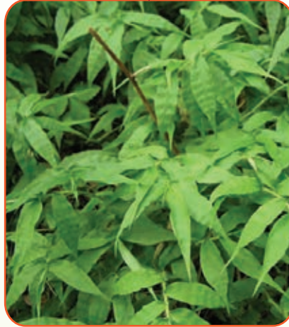
Wavyleaf Basketgrass Oplismenus hirtellus