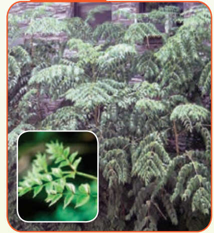
Japanese Angelica Tree Aralia elata