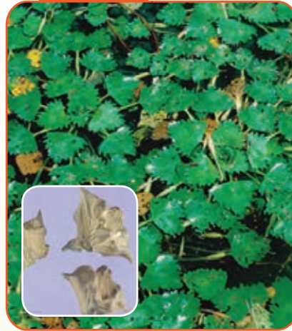
Water Chestnut Trapa natans