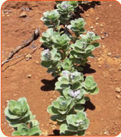
Beach Vitex Vitex rotundifolia