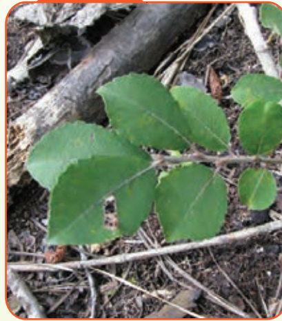
Gray Florist's Willow Salix atrocinerea