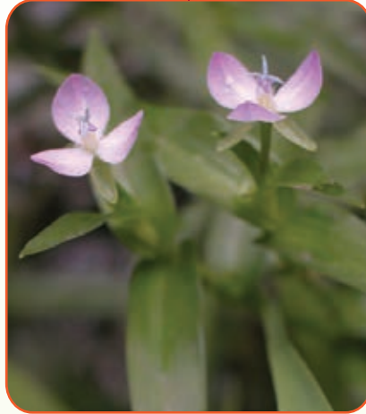
Marsh Dewflower Murdannia keisak