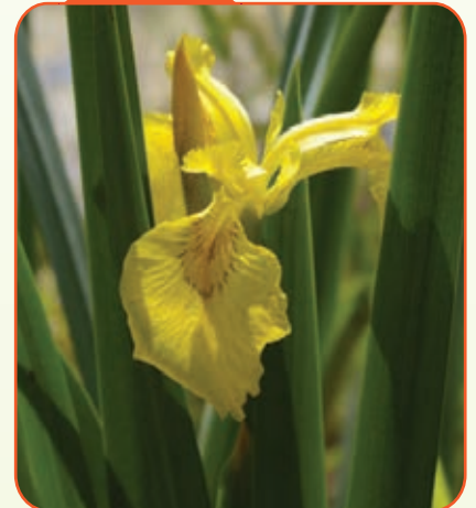
Yellow Iris Iris pseudacorus