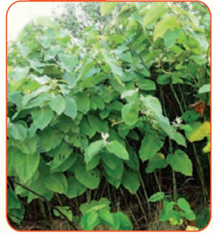
Giant Knotweed Reynoutria sachalinensis ( Fallopia sachalinensis , Polygonum sachalinensis )