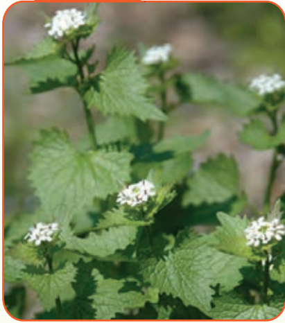
Garlic Mustard Alliaria petiolata