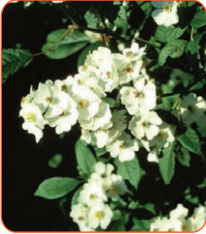
Multiflora Rose Rosa multiflora