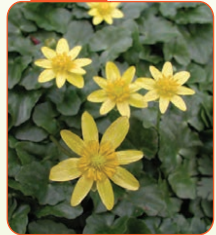
Lesser Celandine Ficaria verna ( Ranunculus ficaria )