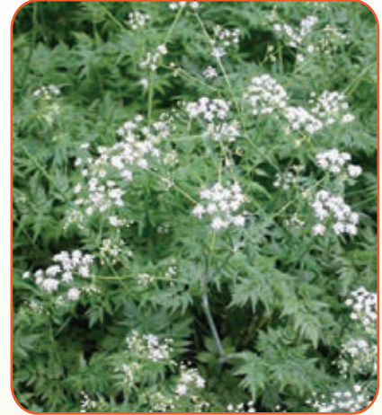
Wild Chervil Anthriscus sylvestris