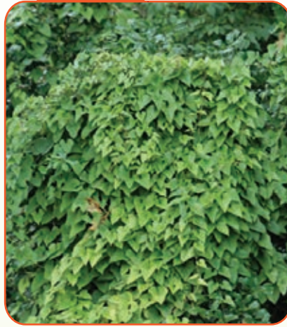
Chinese Yam Dioscorea polystachya (D. batatas)