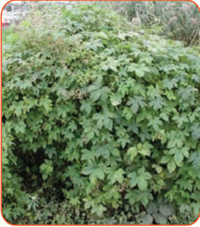
Japanese Hops Humulus japonicus