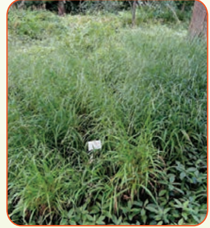
Slender False Brome Brachypodium sylvaticum