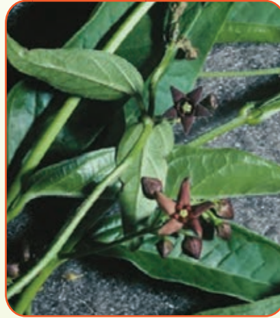
Black Swallow-wort Cynanchum louiseae ( C. nigrum , Vincetoxicum nigrum )