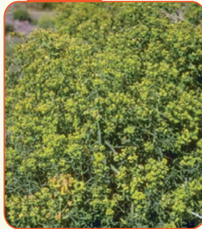
Leafy Spurge Euphorbia esula