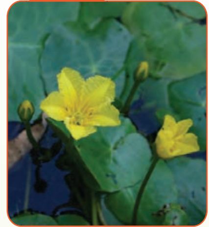
Yellow Floating Heart Nymphoides peltata