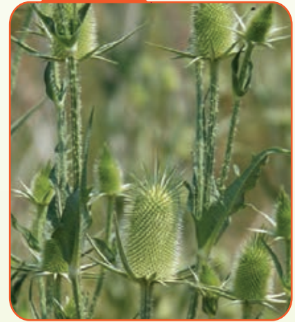
Cut-leaf Teasel Dipsacus laciniatus