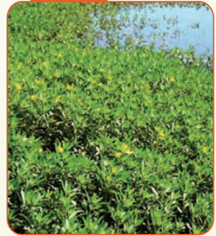
Floating Primrose Willow Ludwigia peploides