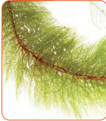
Broadleaf Water-milfoil Hybrid Myriophyllum heterophyllum x M. laxum