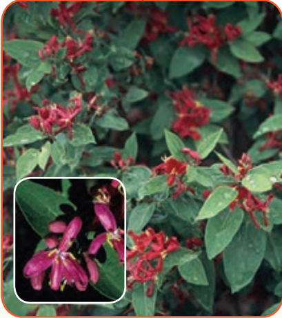
Tartarian Honeysuckle Lonicera tatarica