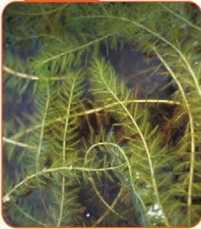
Eurasian Water-milfoil Myriophyllum spicatum