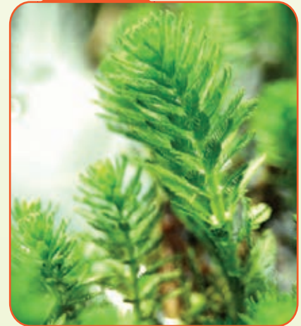
Parrot-feather Myriophyllum aquaticum