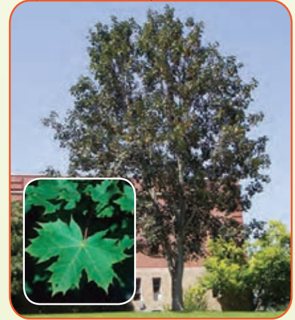
Sycamore Maple Acer pseudoplatanus