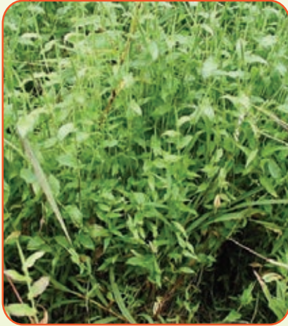
Small Carpetgrass Arthraxon hispidus