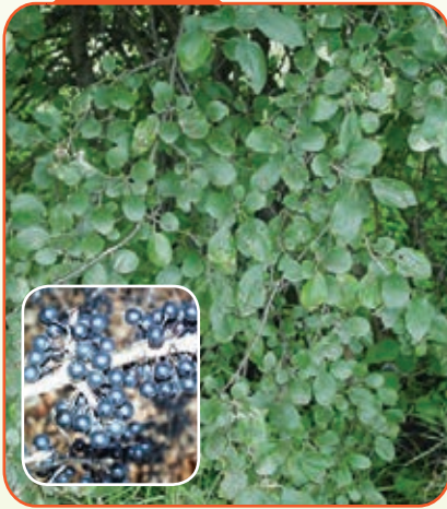
Common Buckthorn Rhamnus cathartica