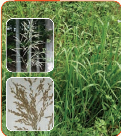
Reed Manna Grass Glyceria maxima