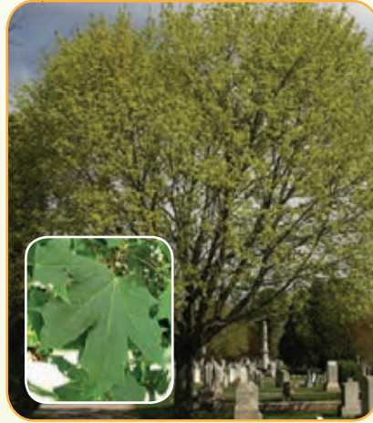
Norway Maple Acer platanoides