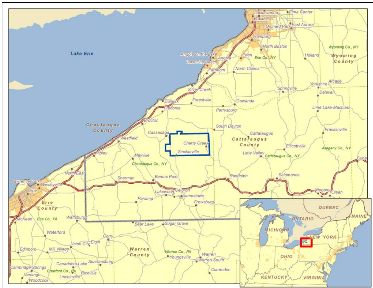
Figure 1: Wind Farm Project Area and Local Communities

The proposed wind energy project area and local communities are depicted in Figure 1, below.